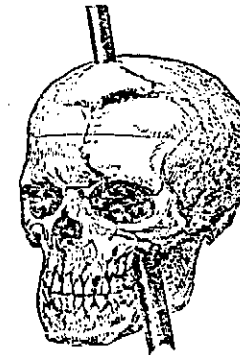
Front and lateral view of the cranium, representing the direction in which the iron traversed its cavity: the present appearance of the line of fracture, and also the large anterior fragment of the frontal bone, which was entirely detached, replaced, and partially re-united.