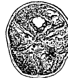
View of the base of the skull from within; the orifice caused by the passage of the iron having been partially closed by the deposit of new bone.